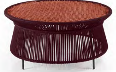
black red/copper/black 01ACALT-N