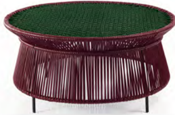
black red/moss green/black 01ACALT-M