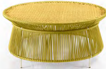
curry yellow/honey yellow/ pearl white 01ACALT-U