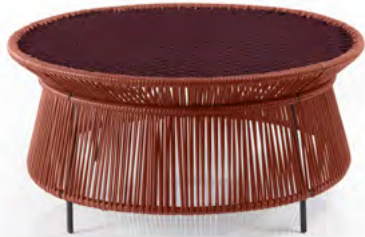
copper/black red/black 01ACALT-O