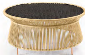
beige/black/beige pink 01ACALT-W