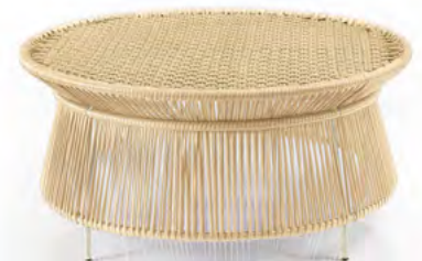
pastel beige/beige/pearl white 01ACALT-V