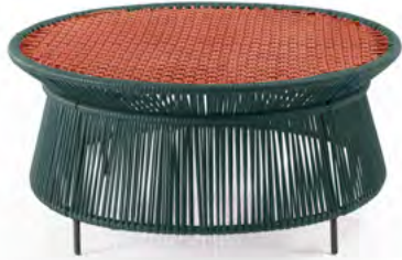
moss green/copper/black 01ACALT-I